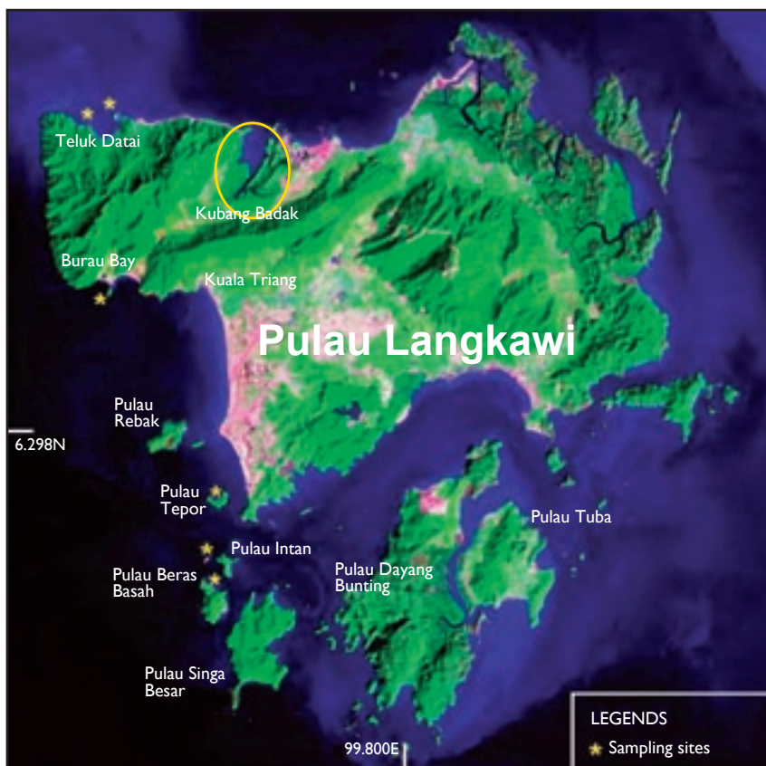
Figure 1. Satellite image of the Langkawi archipelago showing the locations of the survey sites.

It is well known that a tsunami is a fast flowing wave that moves straight across the ocean and onto the land, unlike the circular motions of normal wind- or current-generated waves. Therefore, the