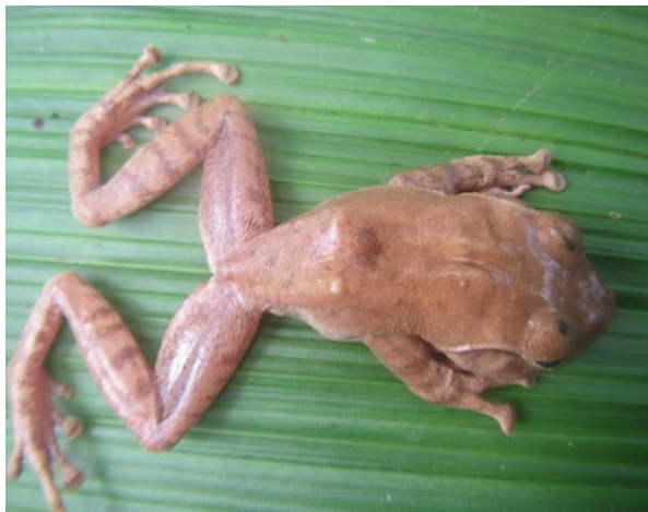
Solomon Island giant tree frog