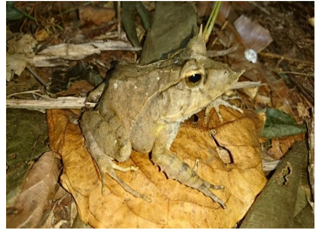
Solomon Island eyelash frog