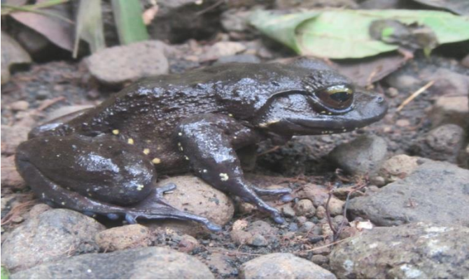
Giant webbed frog