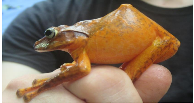
Solomon Island giant tree frog