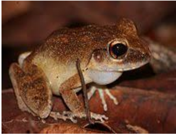
Solomon wrinkled ground frog