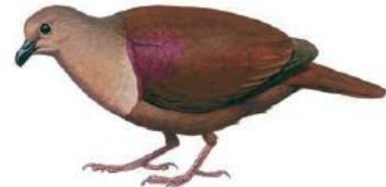
Thick-billed Ground Dove