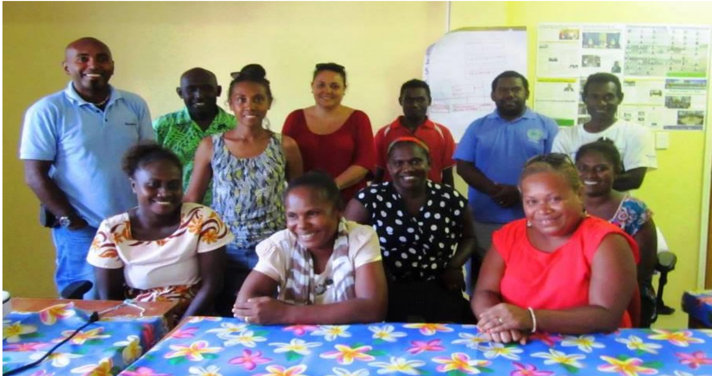
Figure 3. Representatives of different organization in Western Province