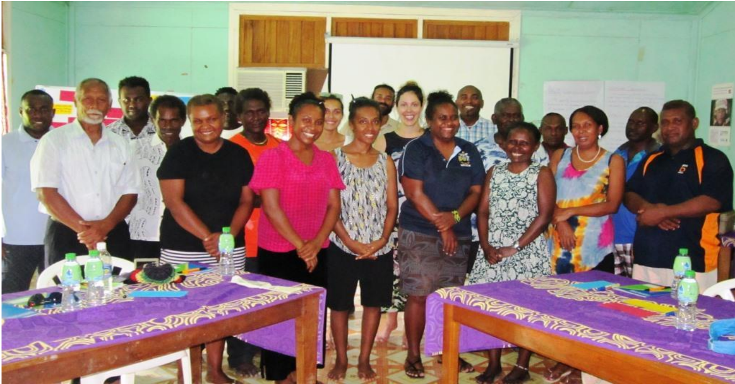
Figure 2. Representatives of different networks who attend the meeting