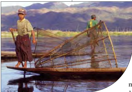
The center also disseminated techniques for participatory consensus-building, initially in coastal areas of South and Southeast Asia and later in floodplain fisheries in Bangladesh and Cambodia, which are especially important to landless rural residents.