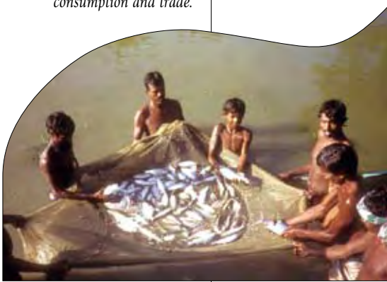
Managing fisheries and aquaculture in the coming decades to sustain and increase fish supplies for both domestic consumption and trade.

The center also disseminated techniques for participatory consensus-building, initially in coastal areas of South and Southeast Asia and later in floodplain fisheries in Bangladesh and Cambodia, which are especially important to landless rural residents. Fish from wetlands supply 46% of all animal protein consumed in Bangladesh, where an award-winning WorldFish project facilitates sustainable incomes from fisheries while protecting fish stocks and restoring biodiversity through community-based fisheries management. The lessons learned and successes attained in Bangladesh are now being applied in Vietnamese communities, where fisheries co-management has become official government policy.