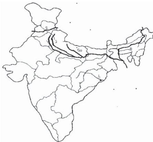
Figure 1. Base population from different rivers of India.