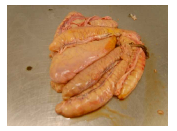
Figure 4: Unprocessed Perch eggs (Roe)

Nile perch is also the largest contributor of fish eggs marketed in the Lake Victoria region. It is estimated that an average Nile perch matures and starts spawning at 3 years of age. Each perch produces about 16 million eggs at a time; when harvested, a mature female perch has an egg sack that weighs about ½ kg. The outer layer of the eggs has a texture similar to a sausage and this makes it easier to roast or deep fry. Figure 4 below shows unprocessed Perch eggs (Roe). Some eggs, especially smaller eggs from tilapia, are sun-dried and sold to the DRC together with other dried fish products.