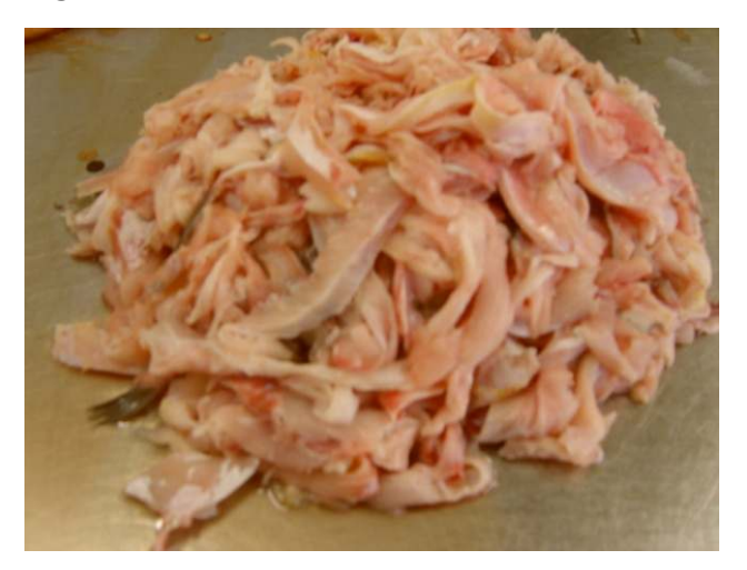
Figure 5: Red meat trimmed from fillets

The quality and size of trimmings also depends on the skill of the person doing the filleting and the size of fish being filleted (Lim and Webster 2006). Smaller fish that are filleted for local markets usually do not generate good quality trimmings. In this case, trimmings are tiny pieces of meat, which in most cases are comprised of threads of fatty meat, skin, and bones. Such pieces are less appealing for human consumption. These meats are often molded into fish balls which are deep fried and sold as snacks. Deep fried fish balls to supplement fish soups and sauces and have become a valuable meat source for low-income groups. At the Ugandan side of the Lake, fish balls weighing around 20 to 25 grams sell for UShs.100 (about US$ 0.06) and are popular especially among street food consumers. Off-cuts are also used to make fish fingers, sausages, patties or balls which are sold in local supermarkets. This area remains underexploited however.