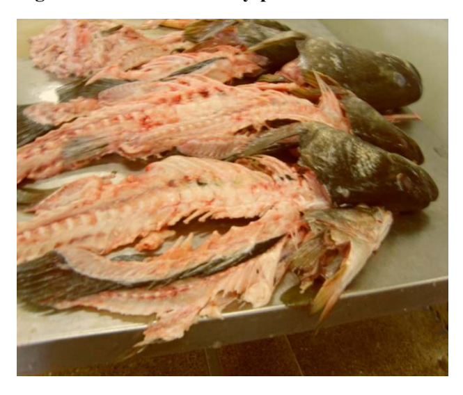
Figure 2: Fish frames at by-product line

In addition, as stocks of perch continue to dwindle, the size of fish available for filleting is getting smaller and this is pushing filleting factories to improve their filleting techniques in order to extract fillet of export grade. Notwithstanding the amount of meat left on the frame, fish frames are popular in cooking because they yield good quality stock and this is important in making stews which are used to accompany the starchy staples that constitute the diet of most populations in the Lake Victoria region.