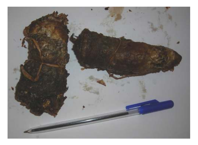
Figure 3: Deep fried fish skin rolls

In Uganda, artisanal processors usually purchase skins from by-product traders. Some skins are used to make fish rolls, that are sold deep fried as shown on Figure 3 below.