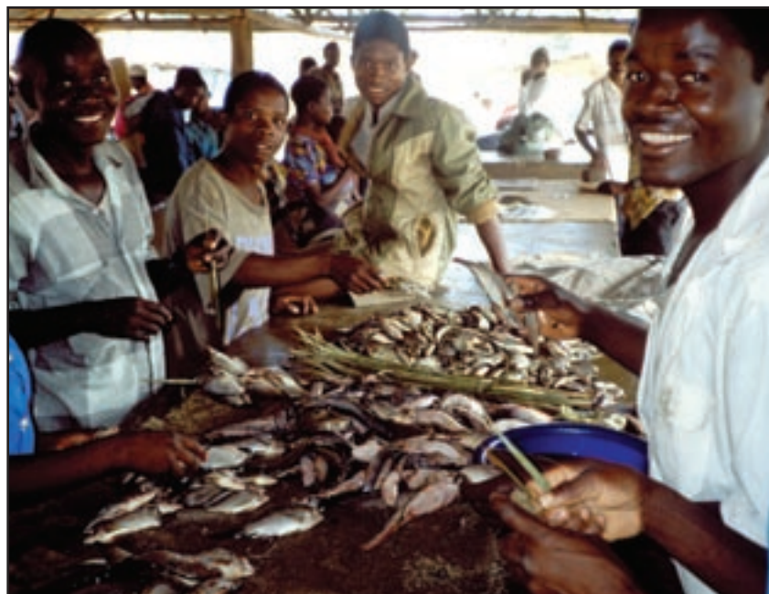
Lake Chilwa fish market.