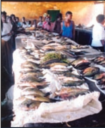
Fish market, Zambezi.