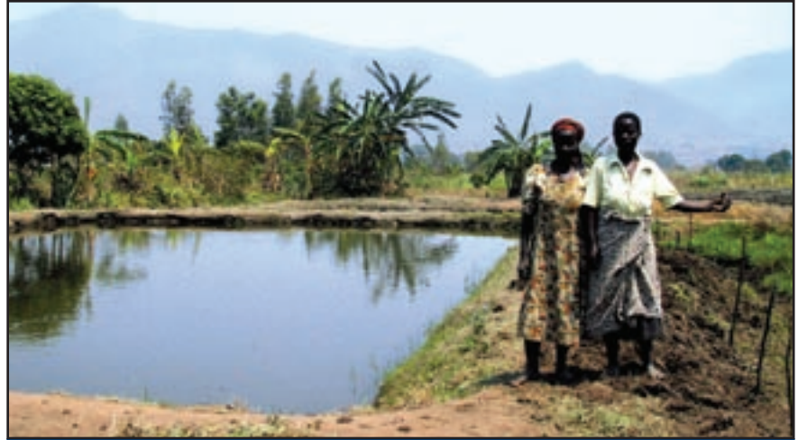
Fish farmers, Malawi.