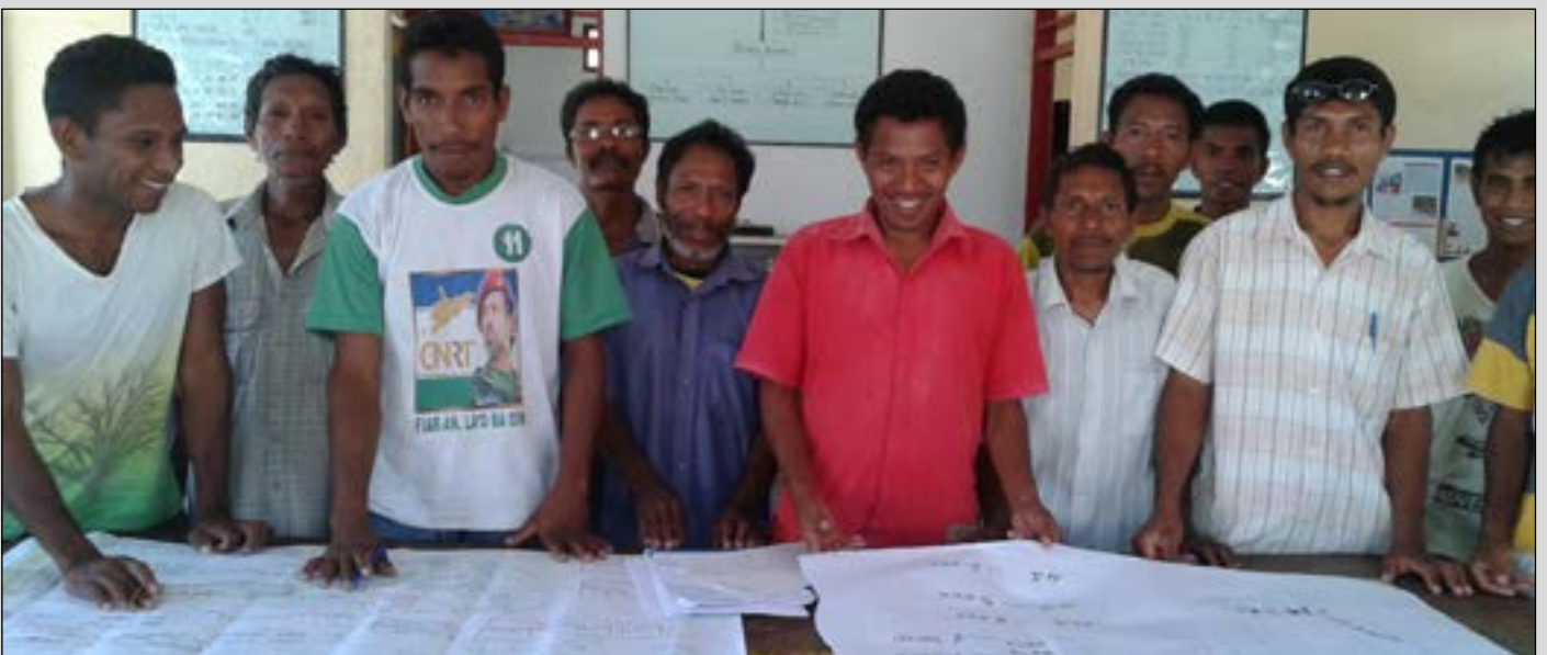
Fig 5: Fishers in Atauro, Timor-Leste, developed and refined decision-tree structures and estimated costs and benefits to enable partial cost-benefit analysis to be conducted on a range of fishing-related adaptation actions. This provided information to help make decisions about the most economically profitable adaptation option.