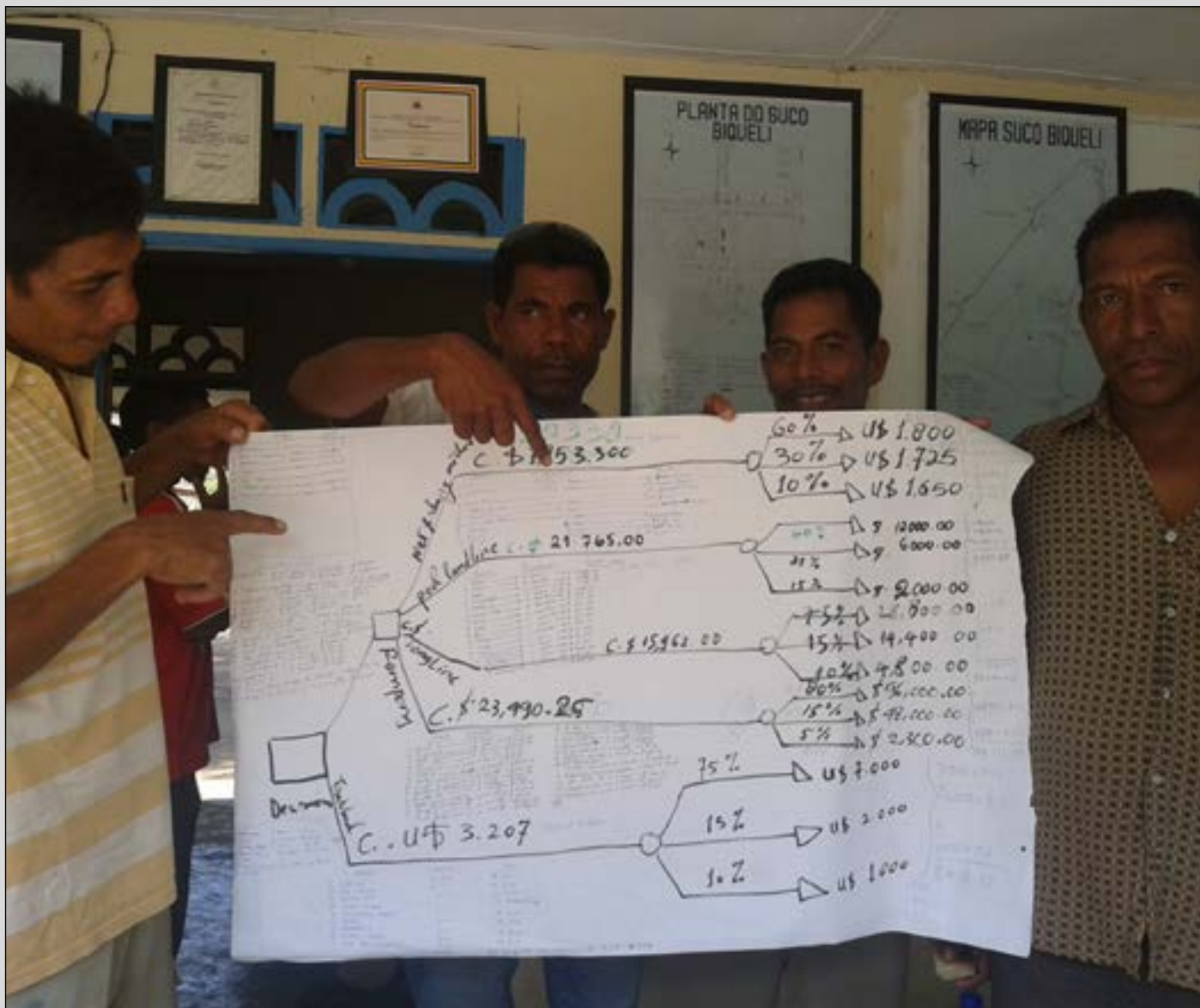
Fig 6: Local stakeholders produced a detailed cost-benefit analysis for different fishing strategies such as net and longline fishing.