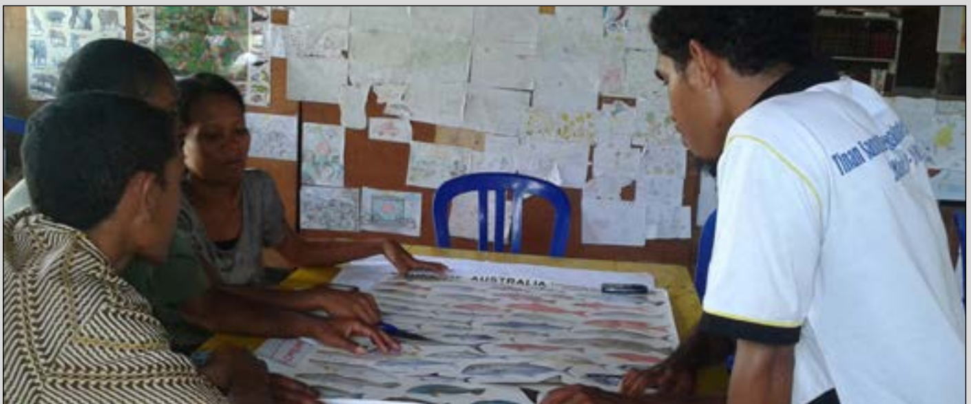
Fig 4: Fishers in Atauro, Timor-Leste, used other resources (fish species posters) to discuss, develop and refine their decision-trees for considering a range of adaptation actions.