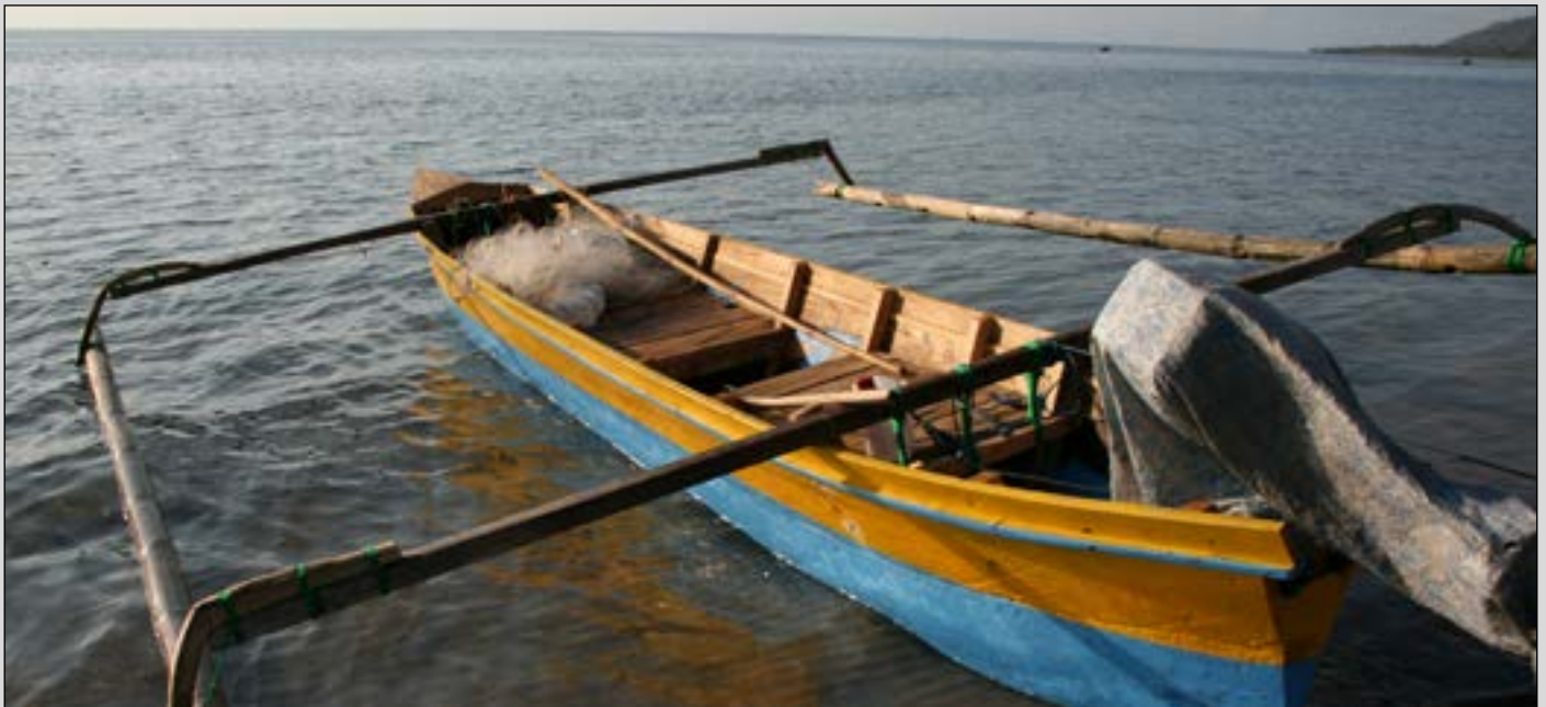
Fig 7: Fuel cost and boat maintenance are important considerations for fishers in Atauro.