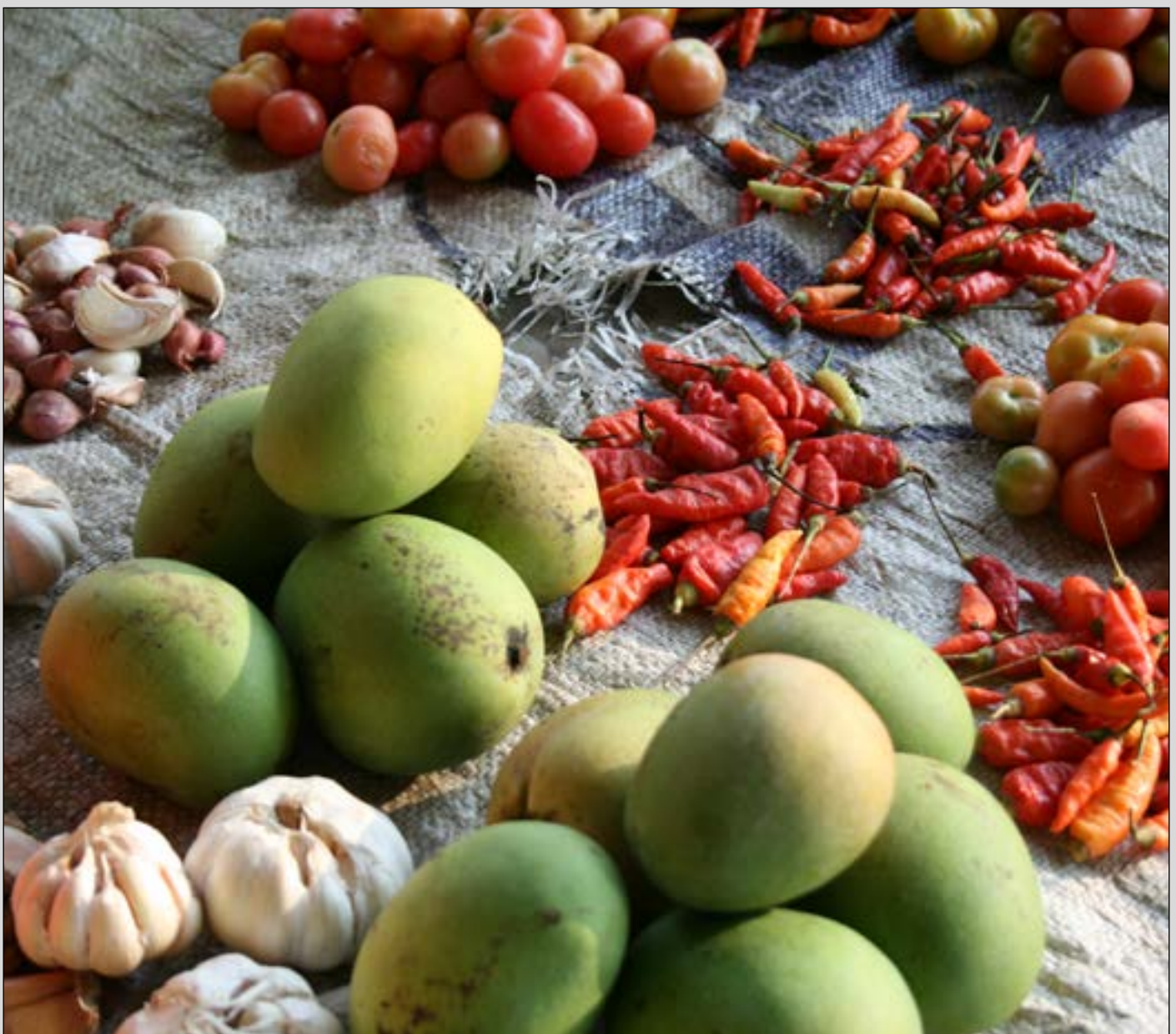
Fig 3: Estimating the returns on different crops can help identify which ones may provide the greatest economic returns. However, some crops may be less reliable in providing good yields every year, due to warmer temperatures and variable rainfall patterns. This uncertainty needs to be factored into decision-making for adaptation.