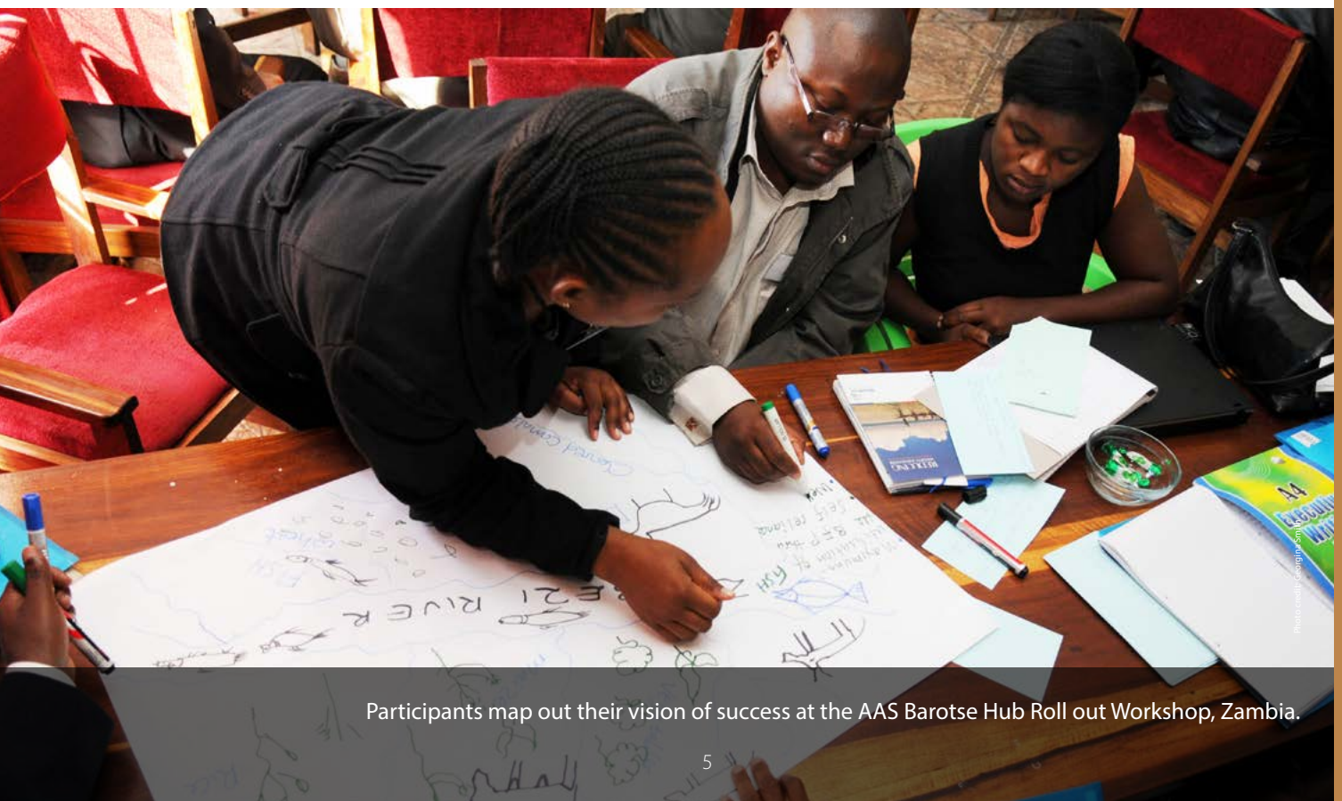
Participants map out their vision of success at the AAS Barotse Hub Roll out Workshop, Zambia.

Together, these capacities form a system's capacity to innovate.