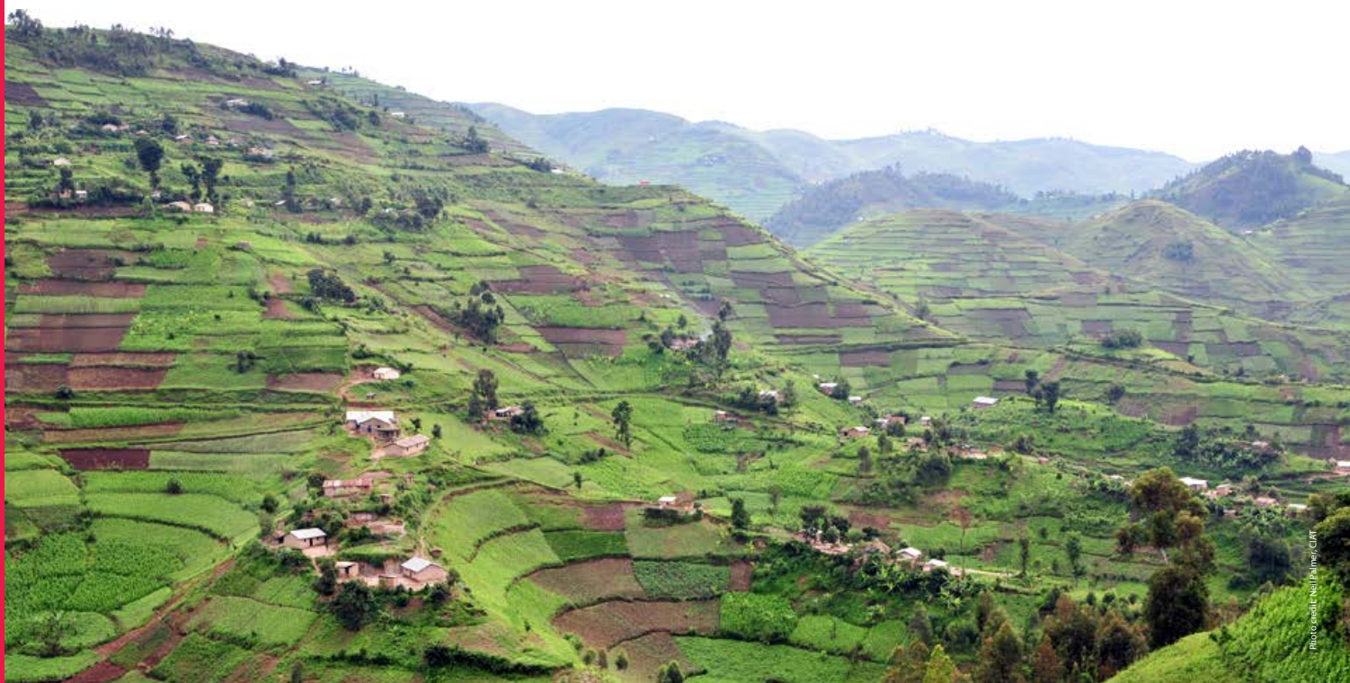
A typical integrated system in the humid tropics: the rolling, cultivated hillsides of southwestern Uganda

As indicated earlier, people and their actions and interactions play an important role in building and changing the coherence of a system. Focusing on increasing resource-poor and vulnerable people's capacity to innovate—that is, focusing on inclusive innovation—can change the power balance, so that these people can recognize more possibilities, unfold their innate creativity, and more confidently tackle newly emerging problems and opportunities in a more equitable world. Supporting such dynamics requires new capacities among a broader set of actors, including the CGIAR system.