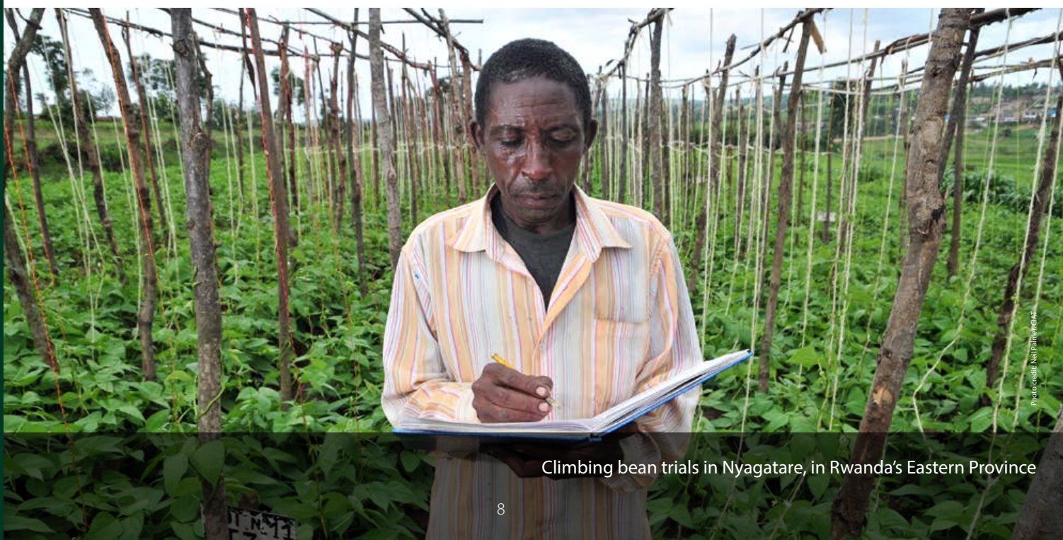
Climbing bean trials in Nyagatare, in Rwanda's Eastern Province

and in the realm of social organization and interaction. Through improved capacity to innovate, stakeholders can select, combine and strengthen specific options, which eventually results in coherent combinations of "hardware" or technical innovations, "orgware" or social innovations, and "software" or adapted mindsets. New orgware may include changes in policy, market organization, legal frameworks, service provision and incentive systems that are necessary to enable people to make use of new ideas and technical opportunities. From a systems perspective, creating these enabling conditions for technology to work needs to be seen as part and parcel of the innovation challenge. Developing successful combinations in one site makes it easier to scale the technology to another. These new combinations will in time result in the realization of other intermediate development outcomes and eventually system-level outcomes. Given the many constraints affecting the countries in which we work, and the fact that system innovations have a time horizon of at least 10 years even under favorable conditions, we are talking about a long-term process.