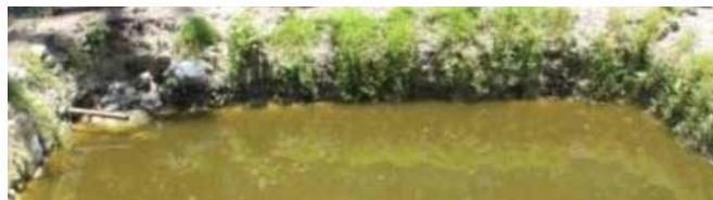
Not Green Enough

You might also have some good ideas on how to control the flow of water coming in and out of your pond.