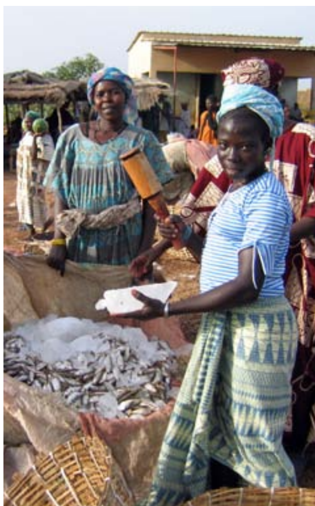
Fresh fish reach Bamako from the Seligie reservoir thanks to access to ice for storage. These women fish traders benefit by getting better prices for their product, Mali, Africa

Fig 1 illustrates the CRP’s intent to identify existing constraints in AAS, develop theories of change to address them, and use these to define RinD priorities in order to move AAS dependent people from positions of asset and income poverty, vulnerability and marginalization to conditions in which they can build income and assets, are resilient and adaptive, and assured of their social, political and economic rights. Gender transformative approaches cross cut all of these efforts, informing both a specific CRP research theme on gender equity as well as the work of five other themes (sustainable productivity; equitable market access; resilience and adaptive capacity; policies and institutions; and innovation and learning). This two-pronged approach responds to learning from past women in development (WID) and gender and development (GAD) practice which identified shortfalls in both relying on separate programs for women, which remained small scale and out of the mainstream of development, and in past efforts at gender mainstreaming which tended to scatter gender concerns and resources across a multitude of interventions, diluting their critical substance and making implementation as well as monitoring, evaluation and impact assessment difficult. 2