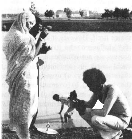
Extension agents examining a fishpond at El-Guneid Sugar Factory—Central Sudan.

The production system is theoretically designed to be continuous over a two-crop system per year, but due to the unavailability of tilapia seed it is confined to only one crop per year.