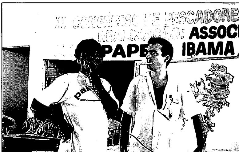
A community leader explains a point to the assembled fishers.

And now the day is at hand. Fishers stream from all directions towards meeting points from where buses take them to "school", the congress venue. It is to begin at 0800, but the sheer numbers overwhelm the volunteer helpers registering the participants, who are to sign the management proposals they will draw up today. Shortly before nine it can begin. More than three-quarters of all fishers are present, 149 persons in total. In addition, senior officials from six government institutions, journalists, a television crew and other interested parties have come.