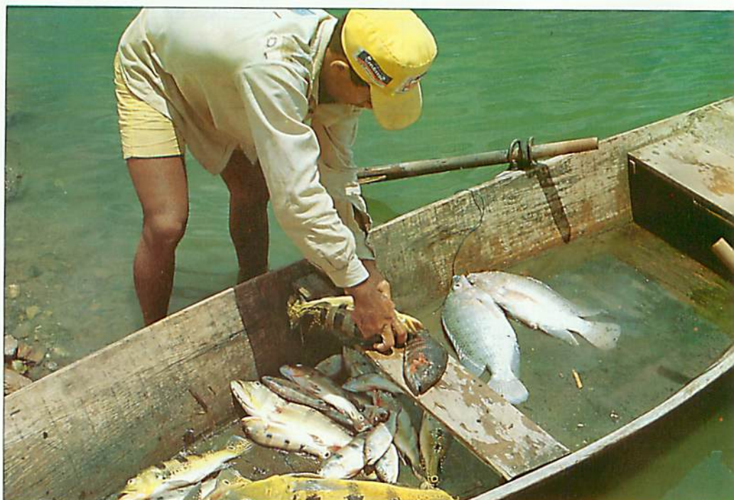
Good-sized tucunaré and Nile tilapia from Caxitoré reservoir.

It is still early and the sun shines out of a clear, blue sky after weeks of rain—a good omen. The atmosphere around the man-made reservoir Caxitoré is spirited, everyone is busy. Food is being prepared, buses are traveling back and forth, last-minute preparations are in hand. Men and women fishers from the seven villages around Caxitoré are to take