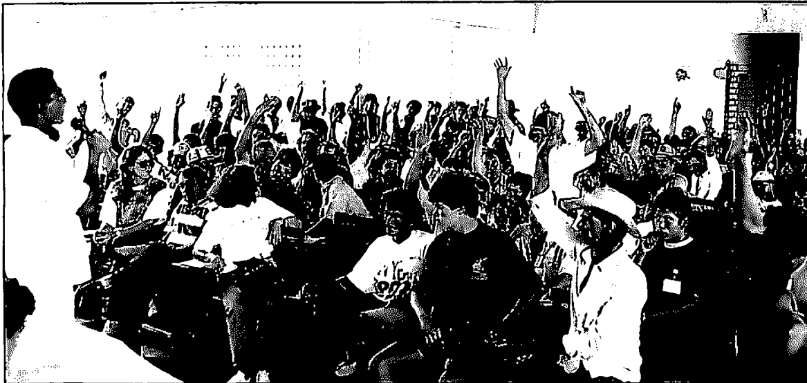
Fishers take a vote on a proposed law.

participated. To assist the process, community leaders were given special training in the moderation of meetings to maximize their impact. During these meetings, the leaders were given responsibility for bringing to paper the fishery management recommendations drawn up by the group. Fishers came together for meetings, week after week, before each community finally could draw up, in consensus, their management proposals. During this period, three groups emerged, formed around the strongest community leaders. These groups decided to address four problem areas for which solutions existed, to avoid the pitfall of discussing everything and deciding nothing.