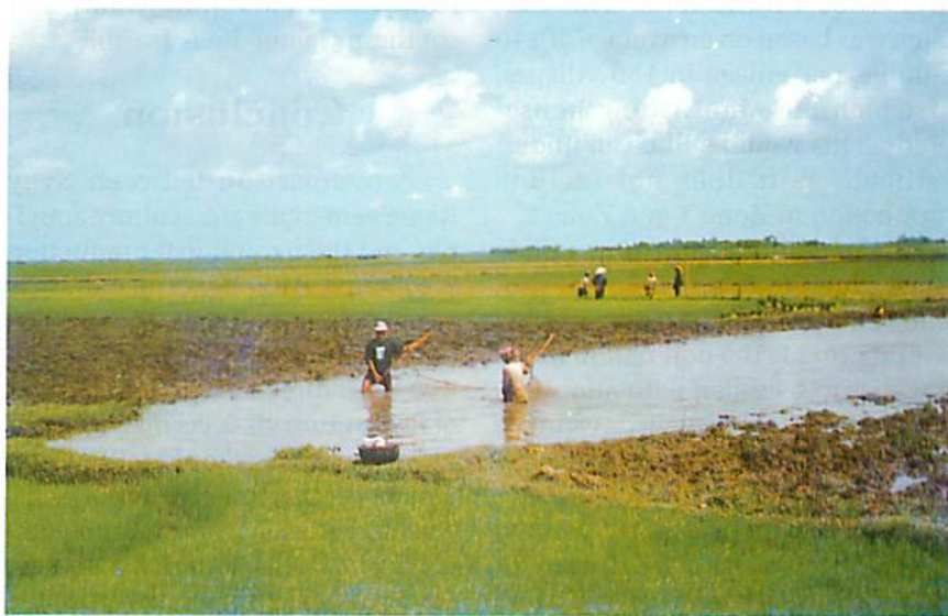
Drag netting is effective at the end of the wet season.

Such a high consumption rate means that an average family of 5 to 6 household members would need between 170-240 kg of fish per year. According to Tana (1993) families close to waterbodies caught 86 kg per family while those further away from waterbodies caught under 30 kg per family per year. He suggests that much of the