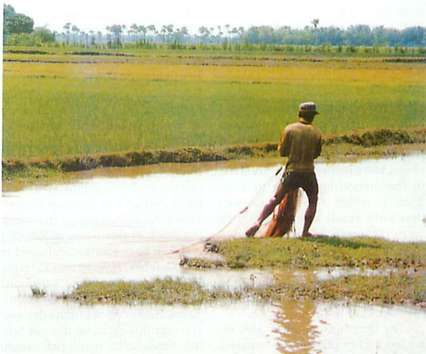
Fishing in a canal next to the rice field .

The households studied had an average fish consumption of about 40 kg/caput/yr (Gregory et al. 1996b). This figure was much higher than earlier estimates and studies in other provinces revealed similar figures. A study in the western part of Takeo province in areas with poor water resources estimated fish consumption to be around 40 kg/caput/yr (CIAP, unpubl. data). The estimate for Kampot province was over 38 kg/caput/yr (APHEDA 1997). Interestingly enough, the households in