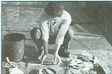
Collecting data on physical size of some fish for their biological study.