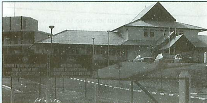
Administration building of SEAFDEC's Marine Resources Development and Management Department.