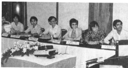
Thai, Indonesian, Philippine and Malaysian participants in the Bangkok Workshop on Aquacultural Economics Research Methods.

The main objective of the AFSSRN is to build national research capacity to deal competently with important socioeconomic issues in the management of the complex tropical fisheries of Southeast Asia and in the development of the region's aquaculture industry. In the past, socioeconomic research on fisheries and aquaculture had been constrained by weak institutional support and by a shortage of economists with special training in fisheries and aquacultural economics. As a long-term program of