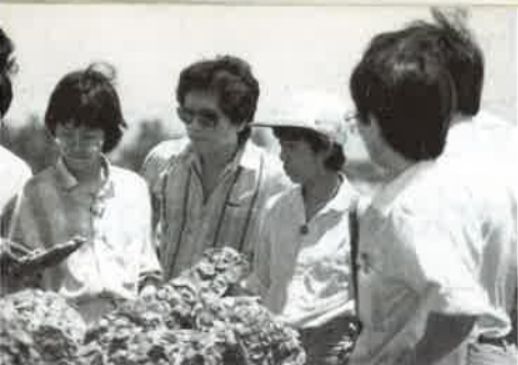
Workshop participants see traditional oyster culture in Ang-Sila, Chonburi, Thailand.

Other Research Reports will soon be available: