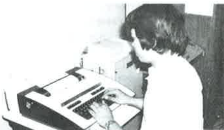
ICLARM's Information Service includes the library (top), computer database searching (center), and publications (bottom).

Readers who are researching topics related to these areas are invited to make use of the information service. No charge is made for the service.